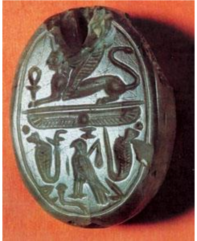
Seal of Jezebel

has not left that option open to us. He did not intend to” (from the book Mere Christianity ).