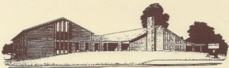
Camden Avenue Church of Christ