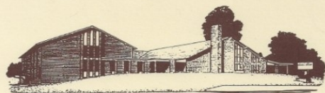
Camden Avenue Church of Christ