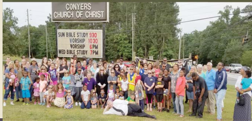
Thank you to all those that made it happen!!