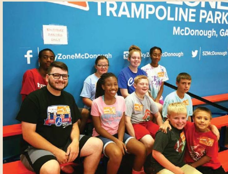
Conyers Youth at SkyZone - 2016 McDonough, GA