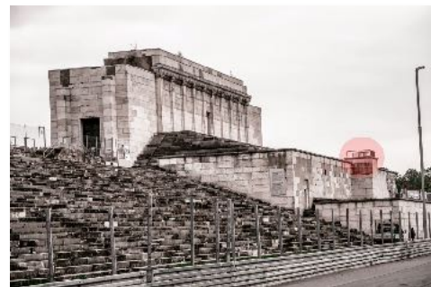
Nuremberg, Germany. The bombed out remains of the stands at the Nazi parade ground. The red circle indicates where Hitler stood making his speeches. Thousands died to save us and many others from his tyranny.

Today, let's remember our Lord who died to assure a home in heaven for us. And let's also remember the men who laid down their lives to preserve the precious freedoms we enjoy — freedom to gather and talk about what God has done for us — perhaps with even more enthusiasm than before.