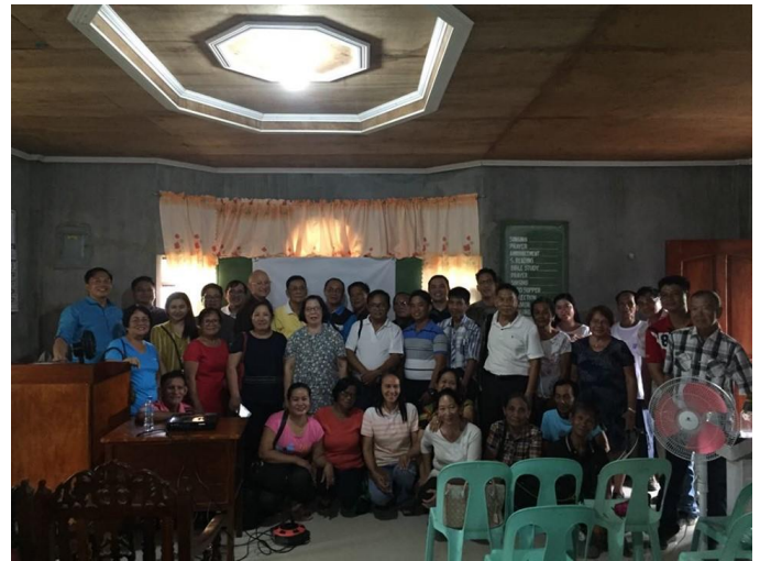
Some of those who attended at Candon. Attendance was at 47.