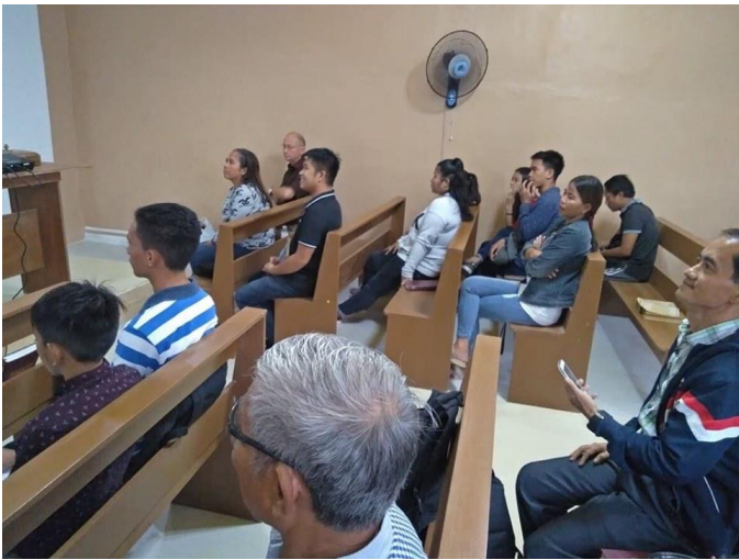
Brethren at Beddeng