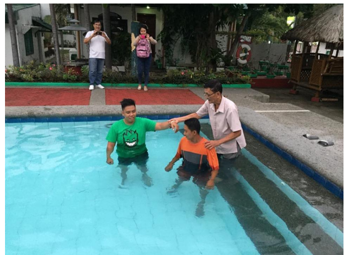
The two souls baptized at Candon