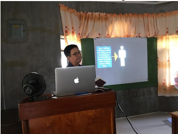
Candon, Ilocos Sur