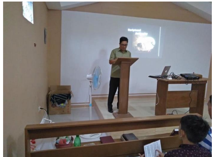
Preaching at Beddeng, San Narciso, Zambales