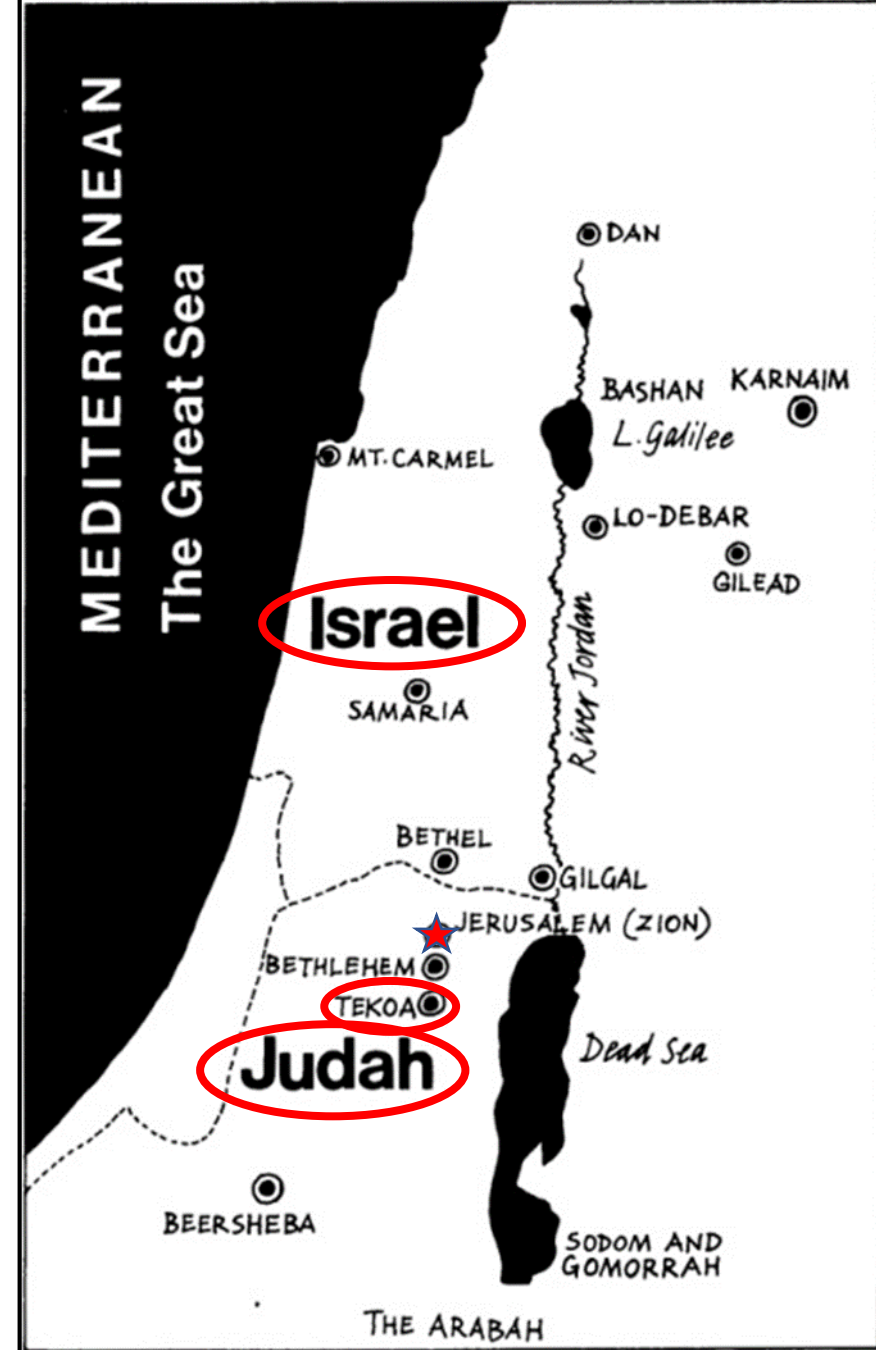
The places in Israel and Judah mentioned in the book of Amos.