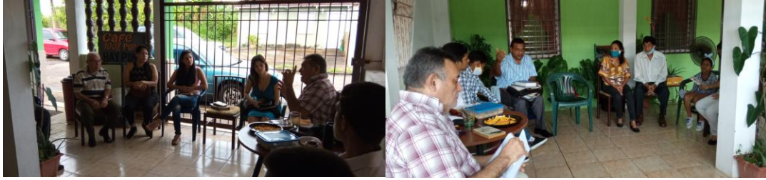
Bible Class in La Línea, to the East of Maturín.