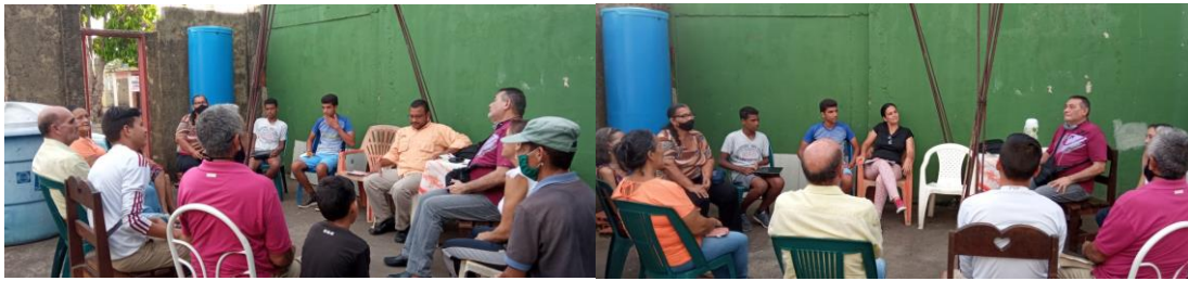
Bible Class in Los Guaritos, to the South of Maturín