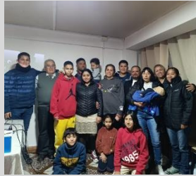
With the brothers from Calama. Teaching the word of God in northern Chile.