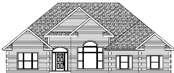
Illustration: Your House Plans