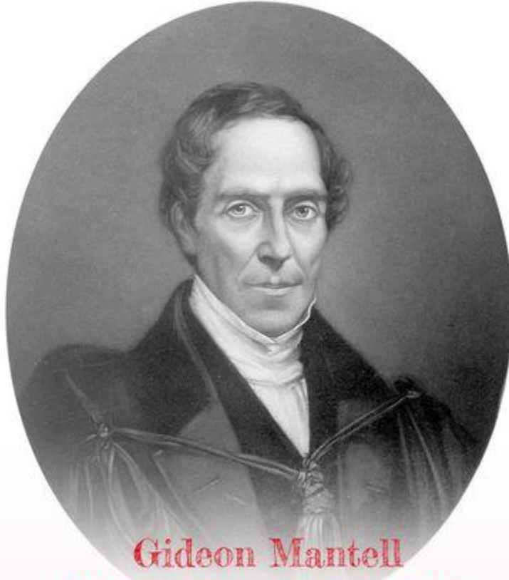
Gideon Mantell 3 February 1790 - 10 November 1852