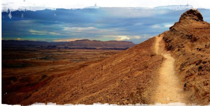
FROM BONDAGE TO FREEDOM | The Story of Israel the books of EXODUS & LEVITICUS & NUMBERS