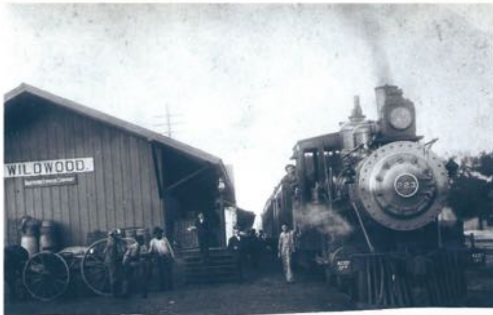
Wildwood is and was a railroad town. Almost everyone who settled here was either employed by the railroad, or fruit growers express. So all us older folks well remember the coal steam engines of the early years, before diesel locomotives made their entrance. Also, we remember well that every train had a caboose. This is an early scene from the old depot in downtown Wildwood...circa 1950's...